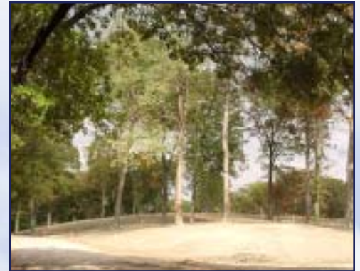
The newly developed Hillcrest Plot before seeding

This new development will provide quality options for in-ground burial to families for many years to come. For information on pricing, or to visit the site, contact one of our Family Service Counselors toll free at 1-877-4-Woodlawn (1-877-496-6352).